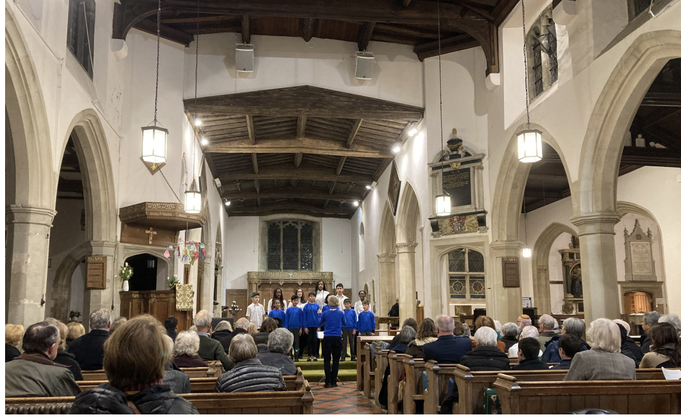
In January Churches Together in Finchley organised the 13th Reflection for Holocaust Memorial Day, honouring the 2023 Theme: Ordinary People. It is a multi-faith, all ages event held annually at St Mary-at-Finchley, with speakers from three local synagogues, two churches, the Council of Christians and Jews and the Mayor of London Borough of Barnet. St Mary-at-Finchley Youth Choir is pictured performing during the service.